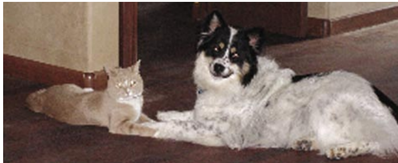
Missy, one of our shelter dogs, got an awesome home in August with a human family who dotes on her. She also gained a feline sibling, Squirrel, as a playmate.