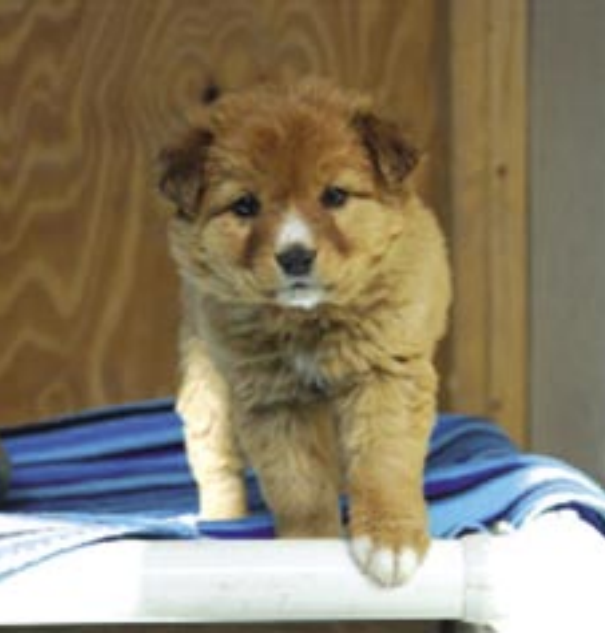
Taffy, a shelter pup (now adopted), enjoys the comfort of a Kuranda Bed.