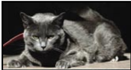
Elegant grey cat got adopted.