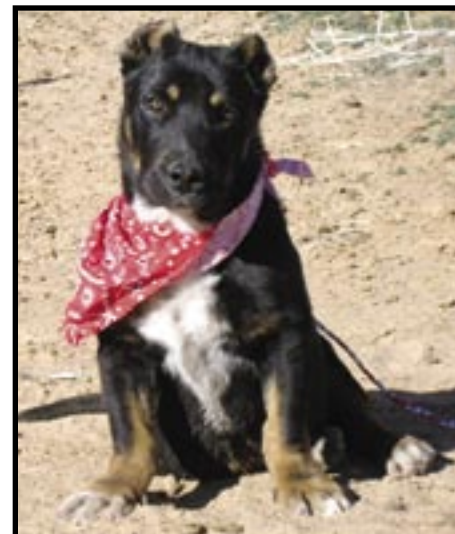
Giant, named for his huge heart; not his size, came into the shelter with mangled ears now plays ball with his teen girl adopter and family in Santa Fe.