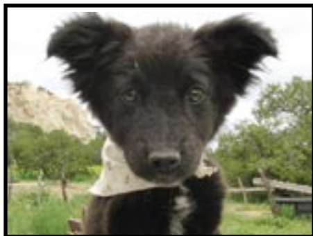
Mickey is now all grown up and in a forever loving home.