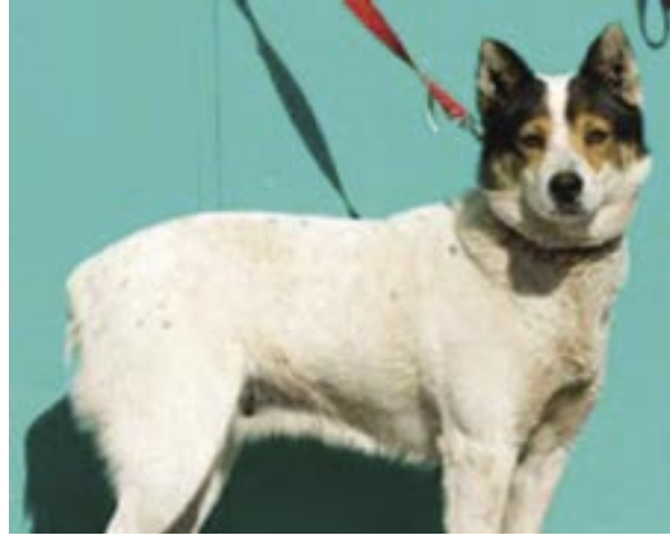
Honey Bun was finally adopted by a local Gallup family.