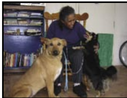
Annie lost a leg, but gained a forever home with a mom and little brother next to an Albuquerque dog park.