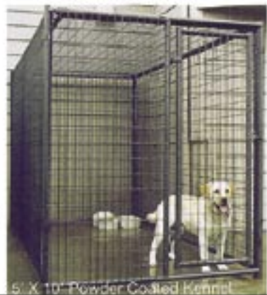
5' X 10' Powder Coated Kennel