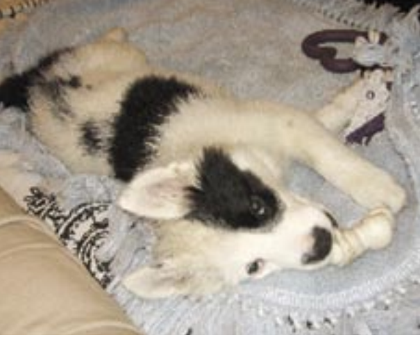
Riley, an energetic pup, now has an active lifestyle with her local Gallup owner.