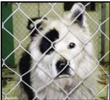
Pirate flew to Maryland to meet his new mom and canine sisters.