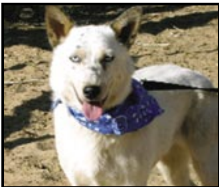
Rascal, a heeler-husky mix that lives up to her name got lucky at an adopt-a-thon and now hikes on the river in Corrales.