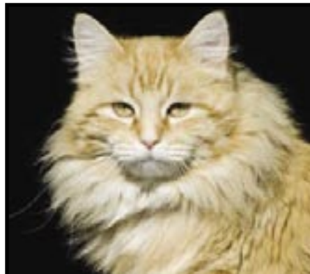
Beautiful yellow tabby got a great home.