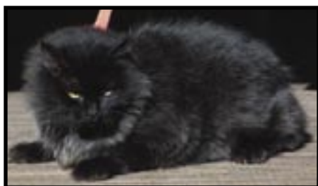
Handsome long-haired black kitty finally got a forever home.