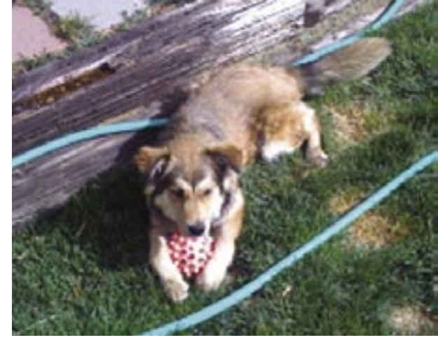
Willow, a Collie-Shep mix pup playing in her Gallup backyard.